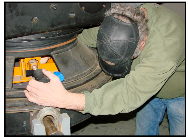
Set the mirror onto the wooden flipping frame. Unscrew the three suspension bolts from the back of the glass.