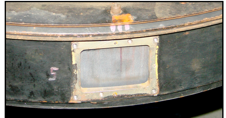
Ready to mount the pivot post.