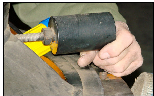
Support the weights with your hand while loosening the suspension bolts