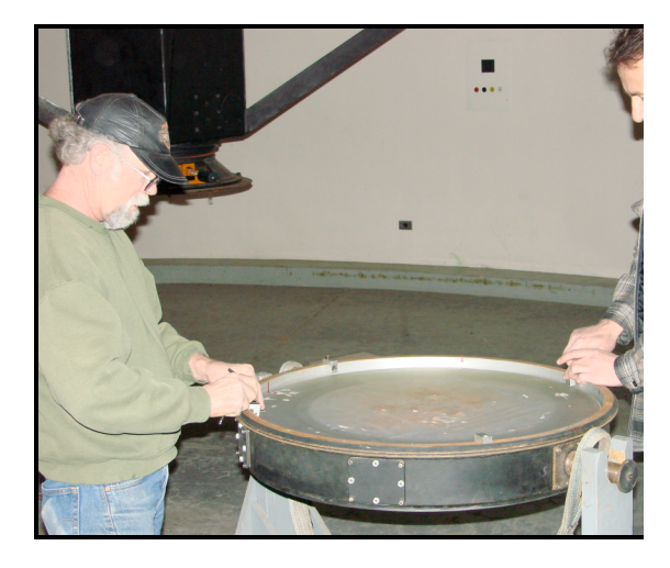
Remove the bolts holding the cell to the secondary frame and move the secondary frame out of the way.