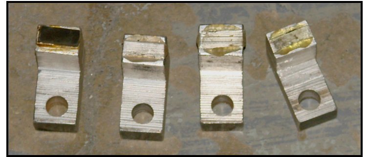
Four safety clips must be installed to hold the mirror when to enable flipping the mirror over. There should be foam on each clip surface that touches the glass for padding.